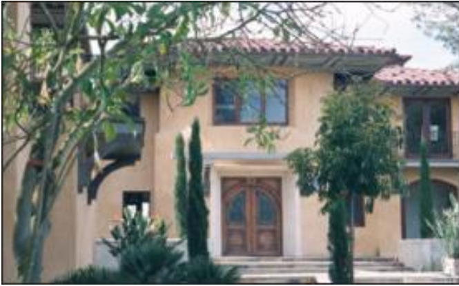
La Jolla, California