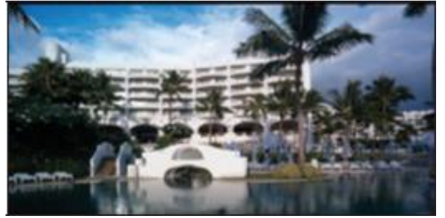
Kea Lani Hotel & Villas, Maui, Hawaii

ArcusStone Products offers a fully integrated and color coordinated system of crushed limestone coatings and plasters, with the durability and finish of quarried stone. All products are installed exclusively by trained Applicators and Stone Artisans.