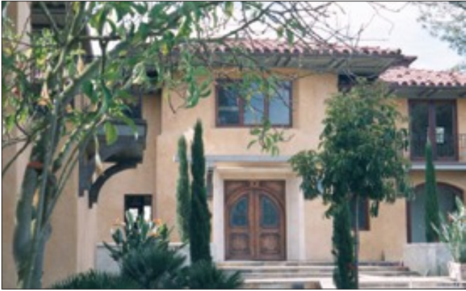
La Jolla, California