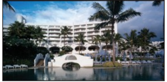
Kea Lani Hotel & Villas, Maui, Hawaii

ArcusStone Products offers a fully integrated and color coordinated system of crushed limestone coatings and plasters, with the durability and finish of quarried stone. All products are installed exclusively by trained Applicators and Stone Artisans.