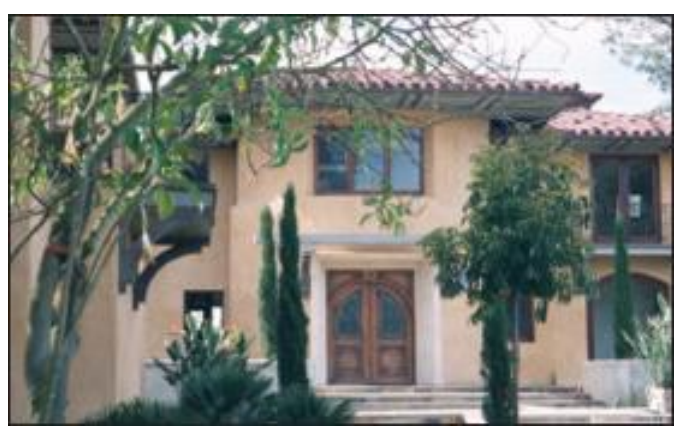
La Jolla, California

ArcusStone Products offers a fully integrated and color coordinated system of crushed limestone coatings and plasters, with the durability and finish of quarried stone. All products are installed exclusively by trained Applicators and Stone Artisans.