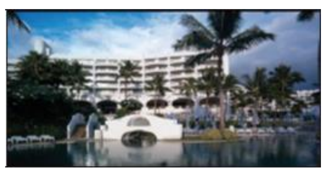
Kea Lani Hotel & Villas, Maui, Hawaii

ArcusStone Products offers a fully integrated and color coordinated system of crushed limestone coatings and plasters, with the durability and finish of quarried stone. All products are installed exclusively by trained Applicators and Stone Artisans.